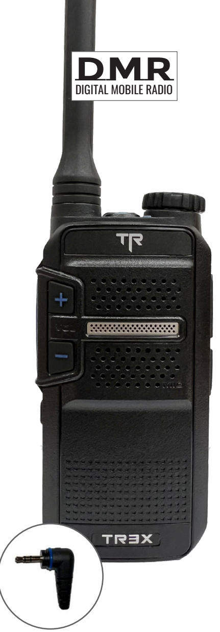
Single Pin Twist Lock Connector